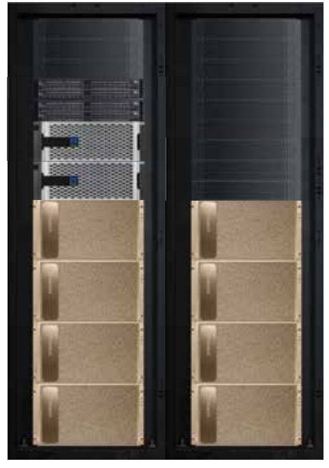
4x SN2700, 2x A800, 8x DGX A100